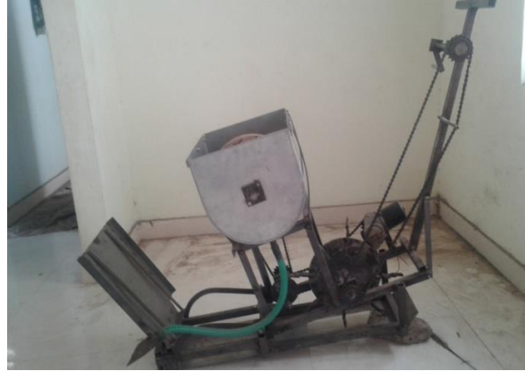
Fig. 2. Photo: Rice planting and seed metering device.