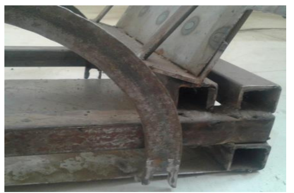
Fig. 3. Photo image of: Plantcatching arm.